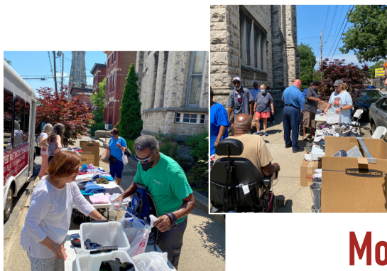
June 2021 Our first Mobile Resource Center