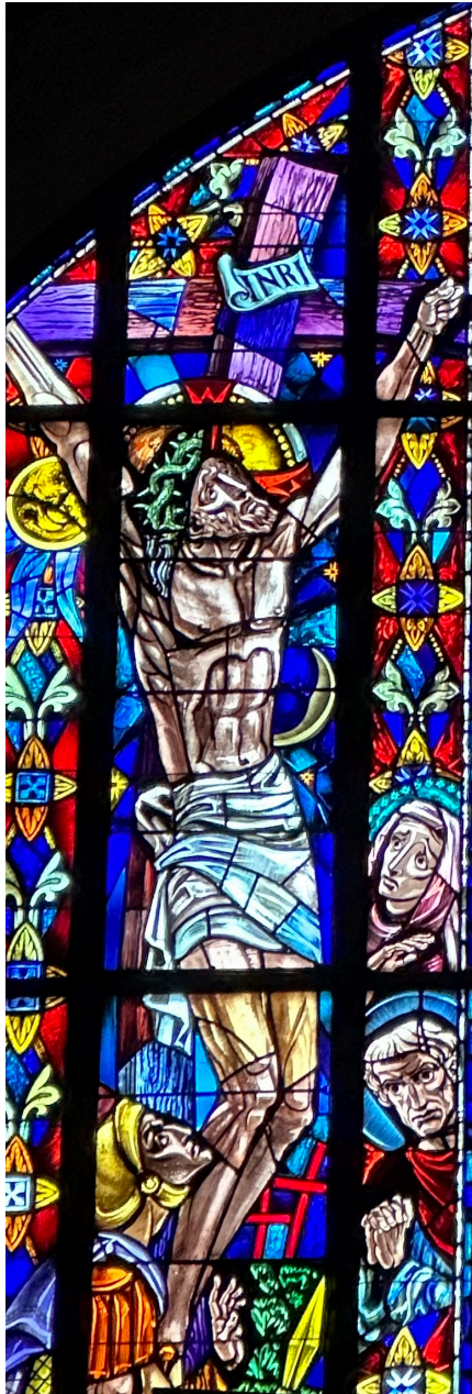
Crucifixion Scene From the Victory Window at St. Paul UMC

St. Paul UMC | 2000 Douglas Blvd., Louisville, KY 40205 | stpaulchurchky.org