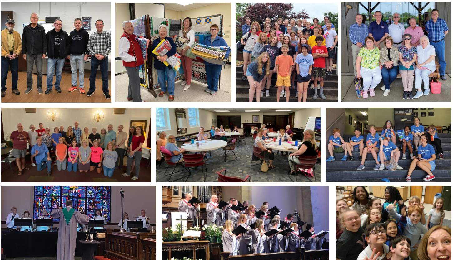
Top row L-R: Men's Group, Faith Quilters, Youth, Safety Team 2nd row L-R: Mobile Resource Center volunteers, Women of the Word Bible Study, Tweens 3rd row L-R: Bells of St. Paul Handbell Ensemble, Chancel Choir, Wesleyan Choir Bottom row L-R: Prayer Beading Group, SPAMs (senior adults)

At the Information Center and around the church, you will find brochures with ways to engage; there's a small groups directory, as well. So consider this your invitation to get connected at St. Paul! You'll fit right in!