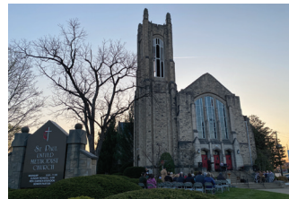
Easter Sunrise Service