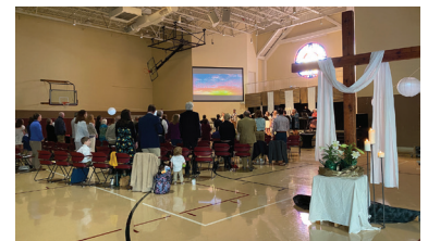
Easter Koinonia Service